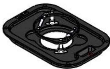
UP-1x35-M For #1 35mm petri-dish