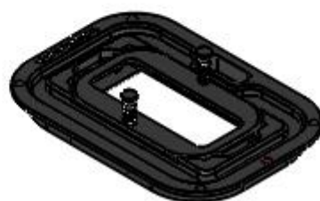
UP-1xLABTEK-M For #1 Lab-Tek-1"x2" chambered cover glass