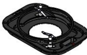
UP-1x60-M For #1 60mm petri-dish